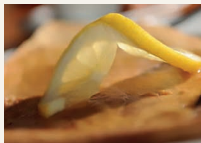
Lemon and sugar