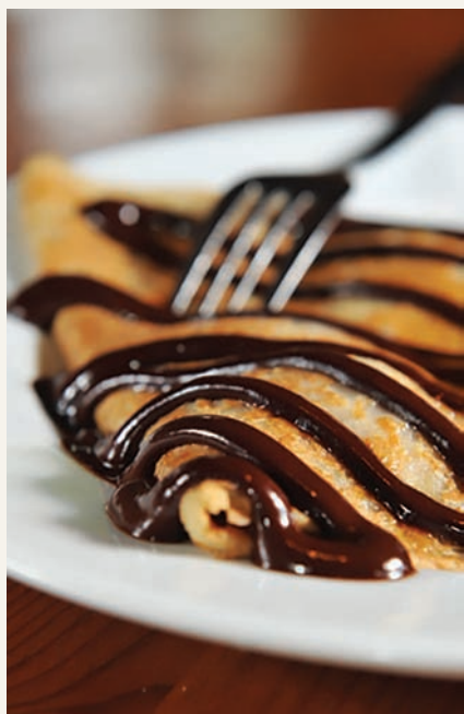
Fruit and chocolate

Freshly made, traditional sweet pancakes