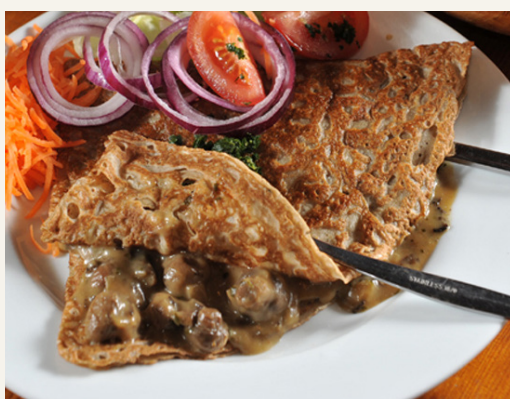
Photo shown: 'Mushroom Stroganoff Galette with extra mixed salad for 4'