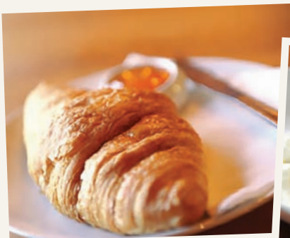
Pictured: Freshly baked croissants.

Add fresh cream for an additional 80p or Mövenpick ice cream for an additional £2.30