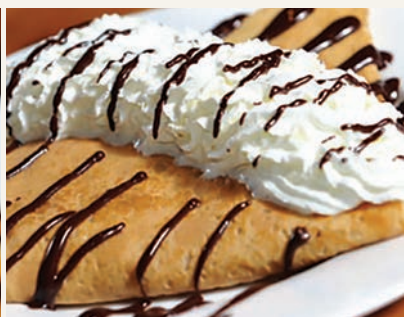
Profiterole with chantilly cream