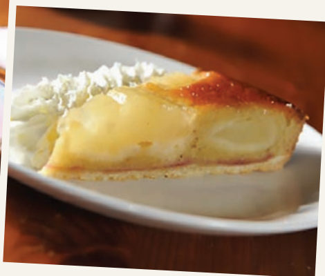
Pictured: Delicious French pear tarts with extra chantilly cream.